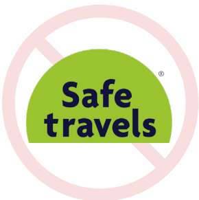
Don't use derivatives or adaptations of the stamp